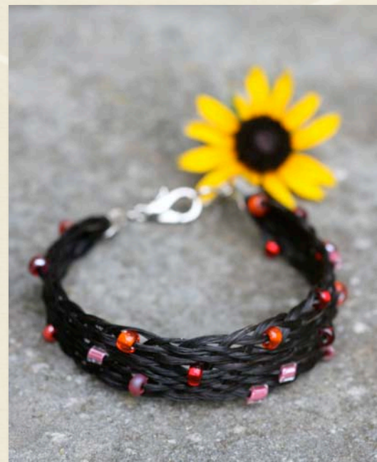
Garden Gala style bracelet braided with beads