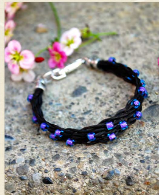
Garden Gala style bracelet with beads